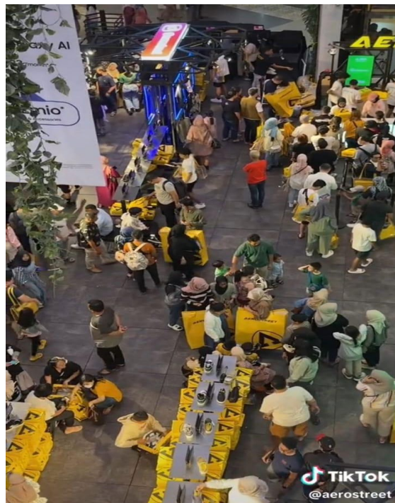
Figure 1: Aerostreet Giant Shopping Bag Promotional Event at 23 Paskal Mall Bandung

A compelling case study highlighting the effectiveness of visual marketing is the campaign launched by Aerostreet, a local Indonesian footwear brand. During a promotional event at 23 Paskal Mall in Bandung, Aerostreet used a giant, bright yellow oversized shopping bag—approximately one meter in size—as its central visual element. This attention-grabbing design successfully attracted visitors and sparked widespread conversation on social media, demonstrating how unconventional visual elements can drive consumer engagement and significantly enhance brand awareness.