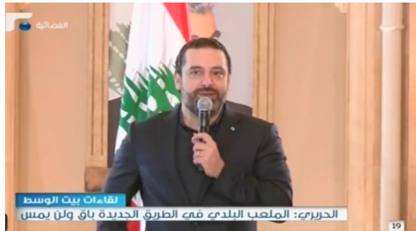
Figure 9: Example of hybrid usage of Facebook from the Future Movement