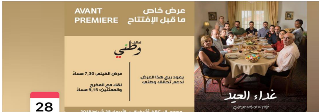
Figure 7: Example of the mobilisation category: fundraising event.

Several interesting and general findings can be summed up. First, the main function attributed to Facebook by all political parties examined is information. The objective is to distribute information and control and expand its flow within the network through different strategies and tools available on the platform. Second, political parties in the opposition and outside the formal institution of power tend to publish more negative and attack posts than incumbents. However, incumbents are more likely to publish about their political achievements. Third, the interaction function is used more by emerging political parties or alliances than the existing political parties in power. Political candidates outside the power are more willing to communicate and exchange ideas with voters and are therefore promoting a more dialogical model of communication in campaigns. Fourth and finally, the use of Facebook as a mechanism of personalisation was generally poor and limited to few emotional posts to attract and mobilise voters.