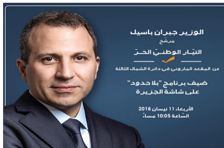
Figure 8: Example of hybrid usage of Facebook from the FPM