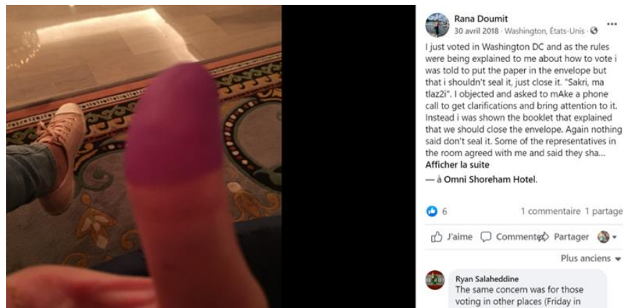
Figure 2: Example of posts posted by a subscriber on Kollouna Watani's Facebook page