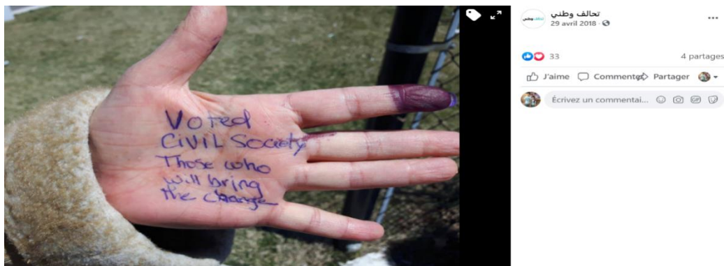
Figure 4: Example of subscriber photo shared by Kollouna Watani page during Lebanese ex-pats voting.

FPM and Kollouna Watani have been effective in using photo and video tools to increase user interaction and engagement with publications. Kollouna Watani interacted much more with subscribers by occasionally responding to their comments or initiating live video question-and-answer sessions. The FM page made much more use of the publication of external links. This method is often insufficient to achieve a high engagement rate. The user engagement was therefore stronger for the Kollouna Watani and FPM pages. The former is on the frontline with a strategy that authorised subscribers not only to comment on page posts, but also to produce publications as illustrated above. To gain more in-depth information and analysis, we carried out a categorical content analysis of the three Facebook pages. This method has been applied to determine the strategic objectives of Facebook usage by political parties. We recall that the content of publications has been categorised into the six categories mentioned earlier in the article.