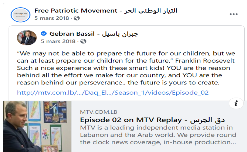
Figure 6: Type of publication of the personalisation category on the FPM page

The interaction function is almost at a standstill for FPM (1.9%) and FM (0%), while it represents 30.4% of the publications of Kollouna Watani. The 46 replies to subscribers made by Kollouna Watani's page were added to the interaction category. The political alliance made larger use of Facebook interaction functions such as live videos, Q&A sessions, and responses to comments from subscribers. The political alliance partly applied a bidirectional way of communication by replying to people. The live videos with interactive questions were also applied by Kollouna Watani's candidates to create a close relationship with users and open the space for a direct dialogue between politicians and citizens. A closer, more personal relationship with users can also be built by politicians sharing their private lives and their feelings and emotions. The personalisation function is significant in the FPM (26%) while it is at a low degree for the FM (5.6%) and Kollouna Watani (2%). Most posts used as a mechanism for personalisation were backstage campaign pictures of candidates, especially Gebran Bassil, the president of the FPM. Some emotional and private posts of Bassil were shared as well on the FPM page.