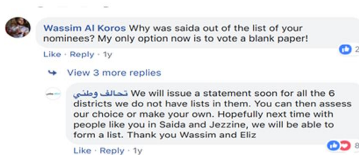
Figure 1: Example of replies from Kollouna Watani’s page to subscriber comments.