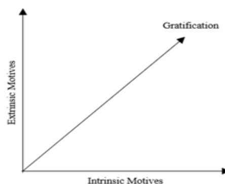
Figure 2: The relationship between intrinsic and extrinsic motives and gratification

The ultimate goal of this article is to consolidate the theories of U&G and ECT as individualistic variables (IV) following Mulder's (Mulder, 2006) viewpoint that not every concept can define reality. U&G is the favoured approach for understanding viewers in the setting of mass communication, while ECT is preferred for comprehending consumers in terms of post-purchase behaviour in the marketing field. Both theories examine the results of service consumption towards satisfaction, which is the dependent variable (DV) in this study. The driving factor of OTT media in this study is based on Richard Oliver's (Oliver, 1980) synthesis of the U&G theory (Katz & Foulkes, 1962) and ECT philosophy (Oliver, 2015). This article uses U&G theory to describe the audience's intrinsic motives to view OTT media while ECT describes the motives controlled by the extrinsic factors, in particular, offers by OTT players that shape clients' resolution to subscribe to OTT media. This article determines whether both intrinsic and extrinsic motives could be accomplished, and whether the audience will obtain pleasure in media consumption.