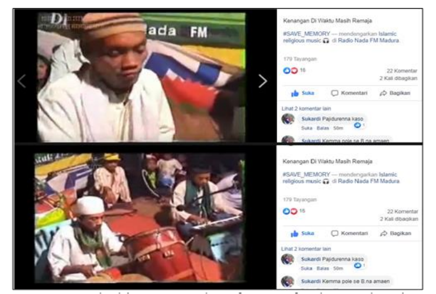
Figure 1: Facebook live streaming: The performance of Madurese traditional instrument music in Islamic religious music of Sumenep Ramadhan Festival

Nada FM made improvements in the news section by adding personnel to the reporter's position for the news coverage programme because, at that time, no radio broadcasted news and local issues about Sumenep and the surrounding area. It also updates the supporting broadcast technology, such as recording studios, editing computers, mixers, on-air computers, and others. The new management was committed to promoting education for the Sumenep residents despite the status of commercial radio. For this reason, all its programmes emphasise the identity of Islamic da'wah and Madurese culture.