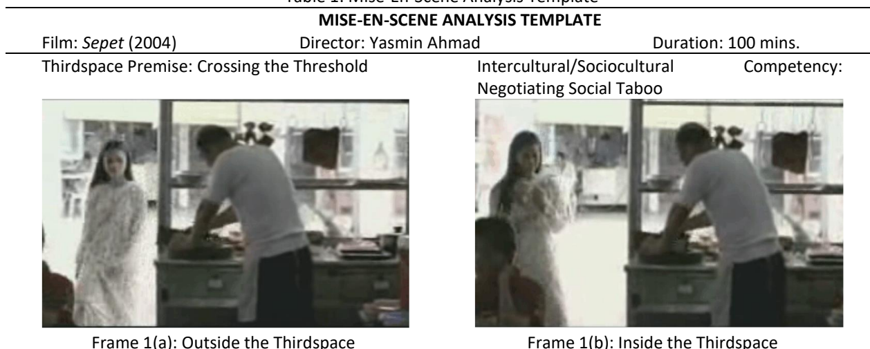
Table 1: Mise-En-Scene Analysis Template