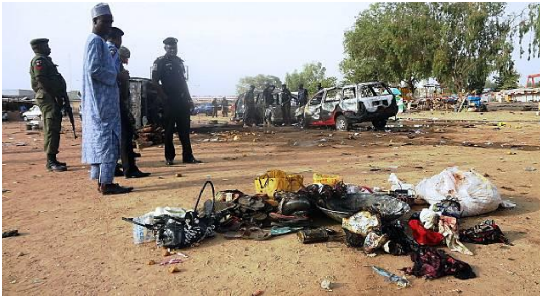
Figure 1: Nigerian Police bomb experts inspect the scene of a suicide bomb attack

Therefore, even though the Boko Haram's ideological prohibition of Western education and Western values were premised on so-called Islamic doctrine, by all means, they are fundamentally rooted in the British colonialists' alteration of the nation's ethnic relationships and political structure. In a nut shell, colonialism can be the root cause of the present breed of faith-based or religious terrorism raging across the world, especially in Sub-Saharan Africa, the Middle East and North Africa (MENA) and South Asia. So, there has been collision between the social, cultural, political and economic values imported by colonial masters and the indigenous ones; thus, over the decades they ultimately breed militancy and terrorism (Abdulazeez, 2016; Barkindo, 2013; Khawaja, 2010; Onyeniyi, 2010).