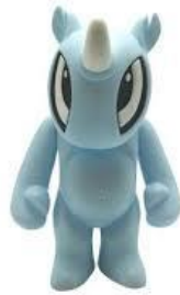
Figure 2: The original works of Indonesian urban toys artist.

both original and custom, urban toys can be a communication medium for Indonesian culture, because the concept of work is placed on these urban toys.