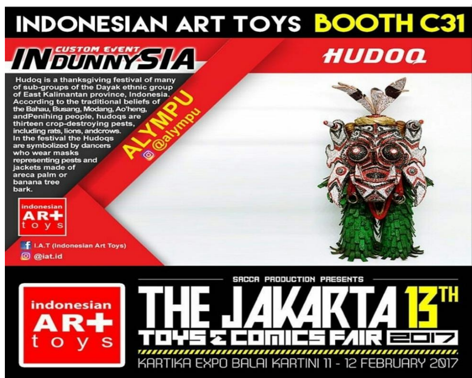
Figure 5: Indonesian urban toys publications and promotions.

Urban toys in promoting culture has strength in three-dimensional elements. IAT as an urban artist community, makes urban toys as visual communication to display miniature artifacts and cultural heritage of Indonesia. IAT considers that through urban toys, it can show Indonesian culture not only with two dimensional communication mediums such as sketch or articles of culture, but urban toy has three dimensions form so it can be enjoyed physically. Urban toys is considered to be a combination of cultural promotion publications, in promoting the culture of urban toys supported by a brief narrative of traditional stories or the caption of Indonesian culture. Through this brief narrative, the artists can communicate the concept of his work while explaining the cultural elements that are being promoted. The appearance in the publication of the concept of the artist's work from the IAT is also a cultural promotion, because each work will be supported by a narrative of its cultural symbols. This can be seen in the sample publication below :