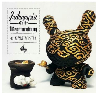
Figure 3: The custom works Indonesian based on dunny platforms.

Urban toys represent the idealism of Indonesian urban toys artists. Currently there is a new paradigm in some Indonesian artists to desire and start incorporating elements of Indonesian culture. The existence of the community makes the artists join and have a common vision and mission in producing urban toys, one of which is promoting and introducing Indonesian culture. The choice of the theme itself is usually discussed from the results of brainstorming conducted regularly at gathering events and in the IAT whatsapp community group. From the making of cultural theme concepts, finally it gives birth to the work of urban toys in the community as a media for promoting Indonesian culture. Some artists will follow a big theme and produce works of urban toys in accordance with their wishes and references. This is as stated by one of the informants (I1):