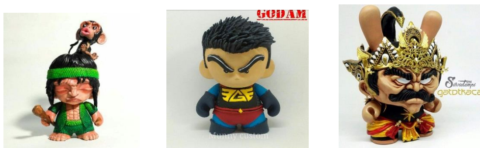
Figure 4: Urban toys themed Indonesian superheroes (Source: IAT Instagram).

Previously IAT had made more pure urban toys, where toys were made based on the creativity of the community members, but in line with the idea and development of concepts, IAT finally tried to put cultural ideology into several works of the urban toys created. IAT utilizes urban toys as a visual communication media to communicate Indonesian culture through several Indonesian cultural heritages. Among the choice of cultural themes made by the IAT includes Indonesian superhero, Indonesian rare animal, Indonesian culture character, and Indonesian cultural artifact pattern.