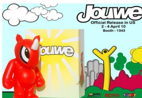
Figure 1: Urban toys with the themed Indonesian culture.

On the one hand this research also saw interesting developments in one of the creative industries in Indonesia, with the emergence of local urban toy artists (Indonesian artists). Initially Indonesian urban toy artists also carried popular themes or concepts, but over time with the growth of Indonesian artists influencing changes in the ideology of artists has boosted Indonesian culture. An example is one of Indonesia's urban toy artists who made platform toys by creating works inspired by rare Indonesian animals, namely the Javan rhinoceros as shown in the picture below.