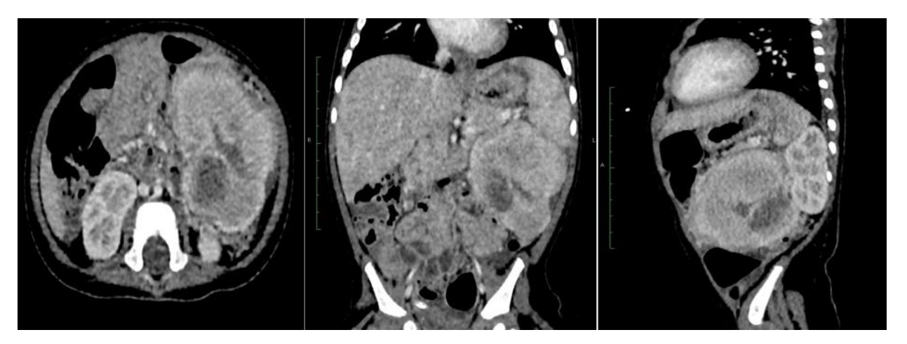
FIGURE 3: CECT abdomen images (in axial, sagittal and coronal slices) showed a large well circumscribed multilobulated enhancing mass at the left side of abdomen, with areas of hypodensities in keeping with necrotic component. Small bowels were displaced to the right side. It was intraperitoneal in location, as it displaced part of the descending colon posteriorly. No claw sign to suggest renal in origin. No enlarged lymph nodes.