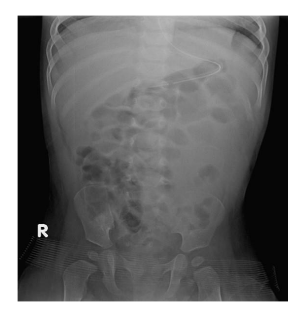
FIGURE 1: Abdominal x-ray showed small bowels displaced to the right side. No bowel dilatation

displaced most of the small bowel loops to the right side, with no bowel dilatation. Posteriorly, the mass compressed onto the anterior aspect of left kidney, with effacement of the anterior perinephric fat.