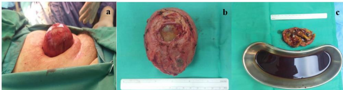
FIGURE 3: (a) Intraoperative showed a large encapsulated seroma after dissection; (b & c) Postoperative specimen showed the encapsulated seroma with its content

Post-operative seroma is a common complication after any surgical procedure. Recurrent and chronic seroma may be troublesome for patients and may lead to other complications. Multiple predisposing factors can contribute to seroma formation, including obesity, large surgical dead space and diabetes mellitus. There is no definitive management of chronic and recurrent seroma in the literature thus far, as most studies focus on preventing seroma formation (8). Surgical principles, including obliterating the dead space and reducing the shearing force, may help to reduce the amount of seroma but do not entirely prevent it.