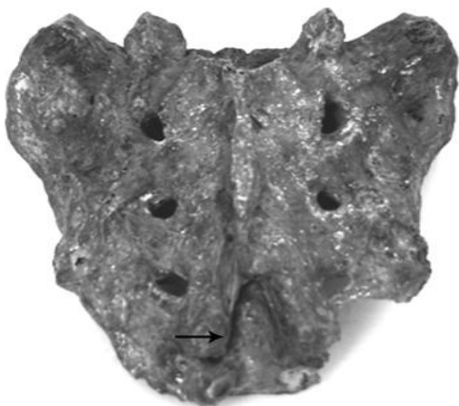
Figure 3: Dorsal aspect of sacrum showing “Inverted V” shaped sacral hiatus.

The posterior elements of the sacral vertebral segments fuse to form a bony plate. The rudimentary spinous processes of the upper three or four sacral vertebrae primarily form the prominent median sacral crest and laminae on either side form the sacral grooves. Often, the bone anatomy of the fourth and fifth sacral vertebrae is absent in the midline resulting in an opening termed the SH (8). It carries a great importance in administration of anaesthesia for caudal epidural blocks required for perineal surgeries, orthopedic practice and