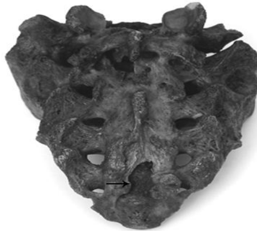
Figure 4: Dorsal aspect of sacrum showing irregularly shaped sacral hiatus