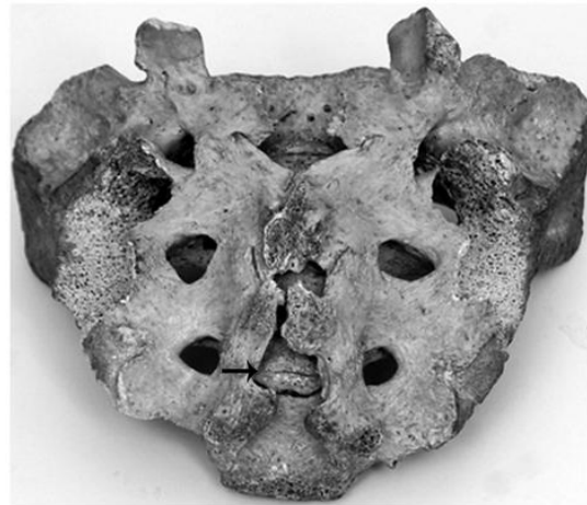
Figure 5: Dorsal aspect of sacrum showing bifid sacral hiatus

various obstetrics and gynecological procedures. Scanty literature was available on the anatomical profile and morphometry of SH in North Indians. Therefore, the present study was conducted on sixty adult human sacra (Males=46, Females=14).