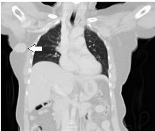
Figure 2: CT scan showed heterogenous lesion at the right axilla with no evidence of distant metastasis (arrow).

Histopathological examination confirmed the diagnosis of leiomyosarcoma (Fig. 3).