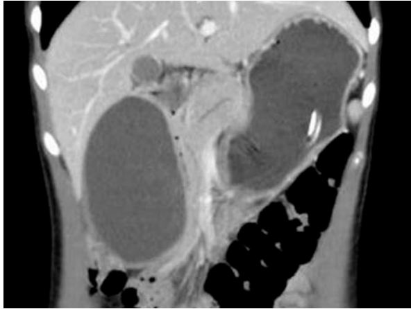
Figure 1: A contrast enhanced CT scan of the abdomen showing a well defined thin walled fluid filled cyst measuring 9.6 x 5.6 x 5.5 cm in the right sub-hepatic area.