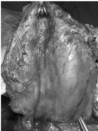
Figure 2: Intra-operatively a 10 x 5 cm cyst was found between the right lobe of liver and duodenum. The figure showing the specimen dissected all around and lifted up.

palpation. There was no guarding or rigidity. Per rectal examination was insignificant, along with all other systems. Serum Amylase was 532 U/L (normal range 30-110 U/L) and lipase 1084 U/L (normal range 5-208 U/L), suggesting pancreatitis. A contrast enhanced CT scan of the abdomen showed a well defined thin walled fluid filled cyst measuring 9.6 x 5.6 x 5.5 cm in the right sub-hepatic area (Fig 1). It was wedged between the 2nd part of the duodenum and right lobe of liver. There was no communication of the cyst with the duodenal lumen, although it was displacing and compressing the pylorus, 1st and 2nd parts of the duodenum medially and the gallbladder superiorly. The pancreas was normal in appearance. The features