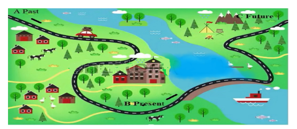
FIGURE 1. Analogy of dream with a person travelling from position A to C

Among humans, plants and animals, sleep is the state of inactivity and break from functioning of the nervous system, whereas other processes such as blood circulation, growth and digestion carry on at an altered speed (Rahman 1964). In slumber, the conscious mental activity halts, but in dreams the gifted people visualize spiritual realities, either events happened already or events in the future that would have otherwise been not possible in the normal situations. Ancient Greek biographer, Plutarch, has suggested that spiritual truths convert into signs in dreams by particular laws of motion that control the instants of these images. Another opinion is that of Ghulam Jillani Burq (1997) who explains that in dream, the person's soul attains an elevation of spiritual presence wherefrom they can distinctly visualize events occurred in past or an event of future. He describes this fact with the assistance of the following figure: