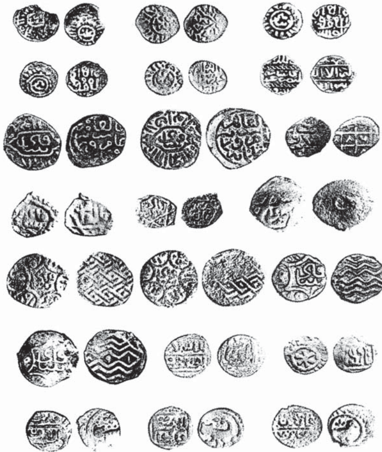
AL-ASHRAF SAYF AL-DĪN QĀ'ITBĀY 873-901 H.