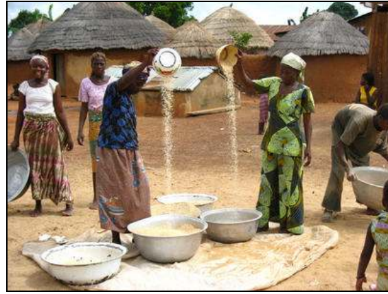
Figs. 2. & 3. Some of the women participants in the KADA micro-loan economic projects