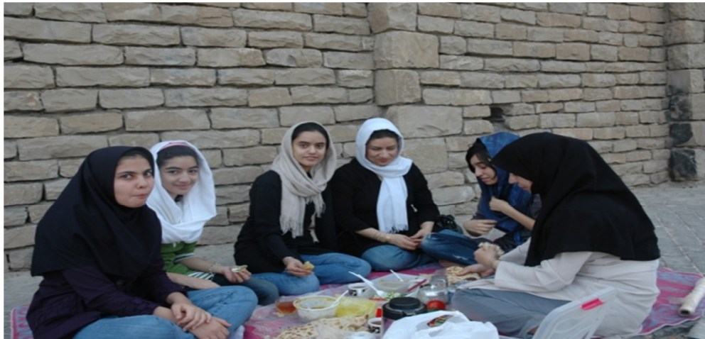
Figure 4. Female adolescents were accompanied by adults for safety and cultural reasons

"My friend's parents and my parents plan, and we go to a park together. In this way, my friend and I can be together."(Female 8, Age 15)