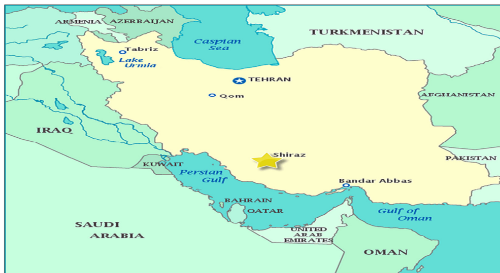
Figure 2. The location of Shiraz, Iran.

The population of Shiraz is 1.3 million based on latest census of 2006. From this population 19.6% are adolescents aged 10-19, and 11.5% are adolescents aged 15-18. Of the adolescent population 51.5 % are male and 48.5% are female (Shiraz Municipality, 2010). Shiraz was once known as the “city of gardens”. Green space per capita for the Shiraz people should be 14.55 m 2 , but it is only 5 m 2 currently. Shiraz has 108 neighbourhood parks, 27 local parks, 35 district parks, and 15 city parks. The area of parks per capita in Shiraz is 1.58 m 2 , but it should be 5 m 2 (Shiraz Municipality, 2010).