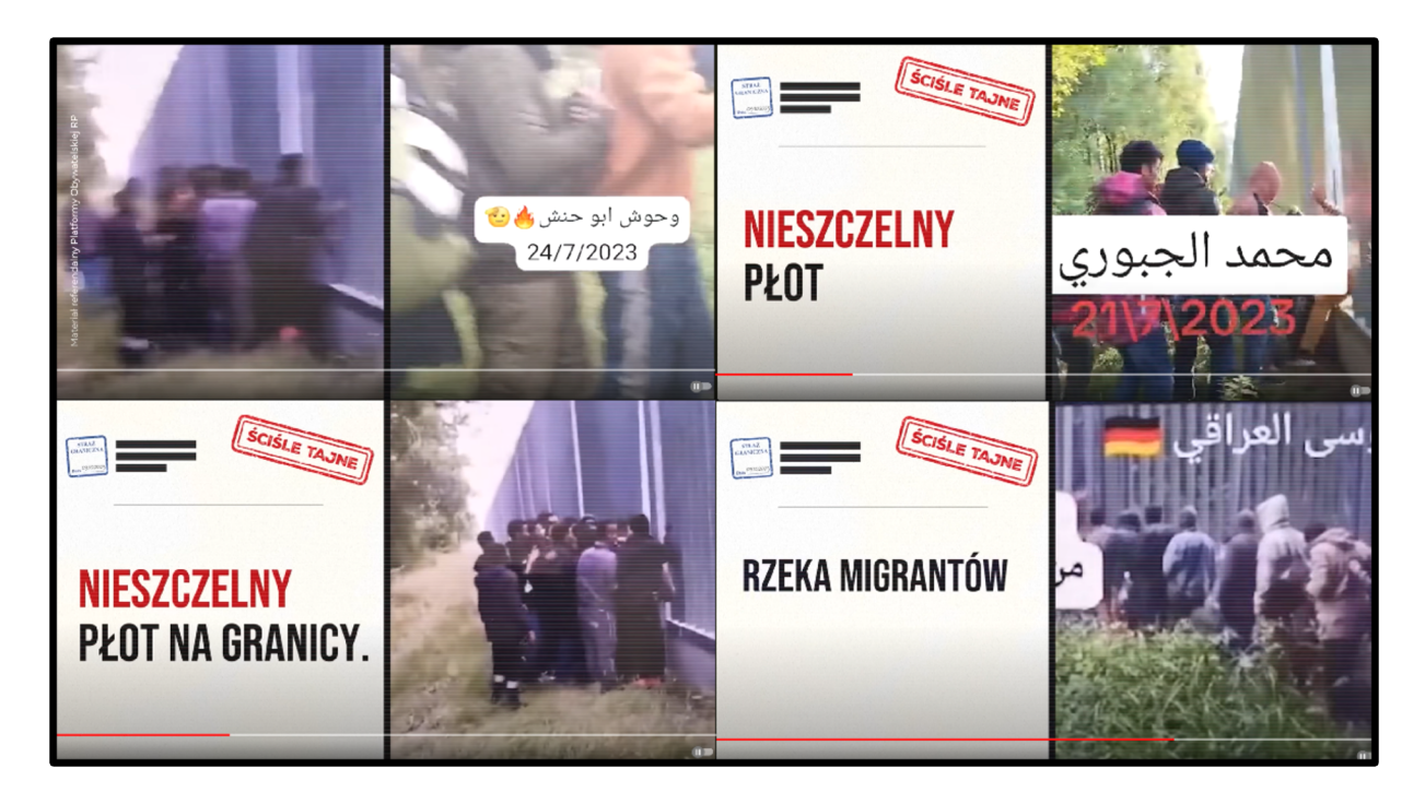
FIGURE 2. The portrayal of people at the border

the latter as belonging to a different, less civilized world, which is amplified by their visual presentation (see Figure 2). The portrayal of the people at the border is generic and exemplifies cultural categorization (cf. van Leeuwen, 2008, pp. 142–144). Only dark-skinned men are presented in the analyzed material. They are almost always shown in groups and no individual traits can be discerned easily. Also, numerous shots depict them storming the barrier, making holes in it or fleeing, which assigns them specific roles (criminals, fugitives, or invaders; see Figure 2, shots depicting people). They are also presented from a distance and their faces are never shown; in fact, they are shown as deliberately hiding them (they wear hoods or caps). Thus, in line with van Leeuwen's (2008, pp. 141–147) toolkit, one could say that their visual representation is clearly intended to invoke negative connotations. In fact, studies by Martínez Lirola (2023, 2016), which similarly used the above-mentioned framework in her investigations of the linguistic and visual construal of immigrants in the Spanish press, evidence that such portrayal contributes to their criminalization by construing them as causing problems and their presence being a burden to the country of their arrival. In addition, their depiction as anonymous individuals homogenizes people at the border.