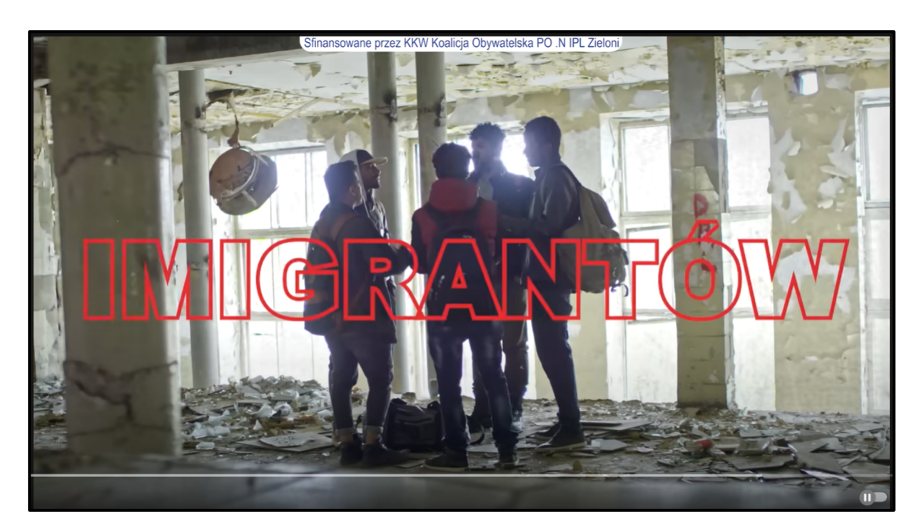
FIGURE 5. Immigrants hiding in a dilapidated building

If interactions are indeed shown, migrants and refugees talk only to each other, which only emphasizes their distance from Poles and Europeans. For instance, the shot which shows five young men talking to each other depicts them from a distance, making the viewer of the material think of them as strangers (see Figure 5). As van Leeuwen (2008, p. 138) argues, in shots or photographs, distance takes on a symbolic dimension. People shown in close-up are depicted as if they were an important part of a group of their own; on the other hand, people shown from a distance are treated as not belonging to it. What is more, the building that the young men are in is abandoned and in complete disrepair. Plaster is falling off the walls, graffiti is visible on the columns, and the floor is covered with broken glass and trash. The men themselves are wearing jackets and carrying bags and backpacks. This visual representation suggests that they are constantly on the move – perhaps they are in "Poland" illegally and need to escape the police or border guards. This is an example of assigning specific roles to the depicted (cf. van Leeuwen, 2008, pp. 142–143) – they are unequivocally portrayed as fugitives.