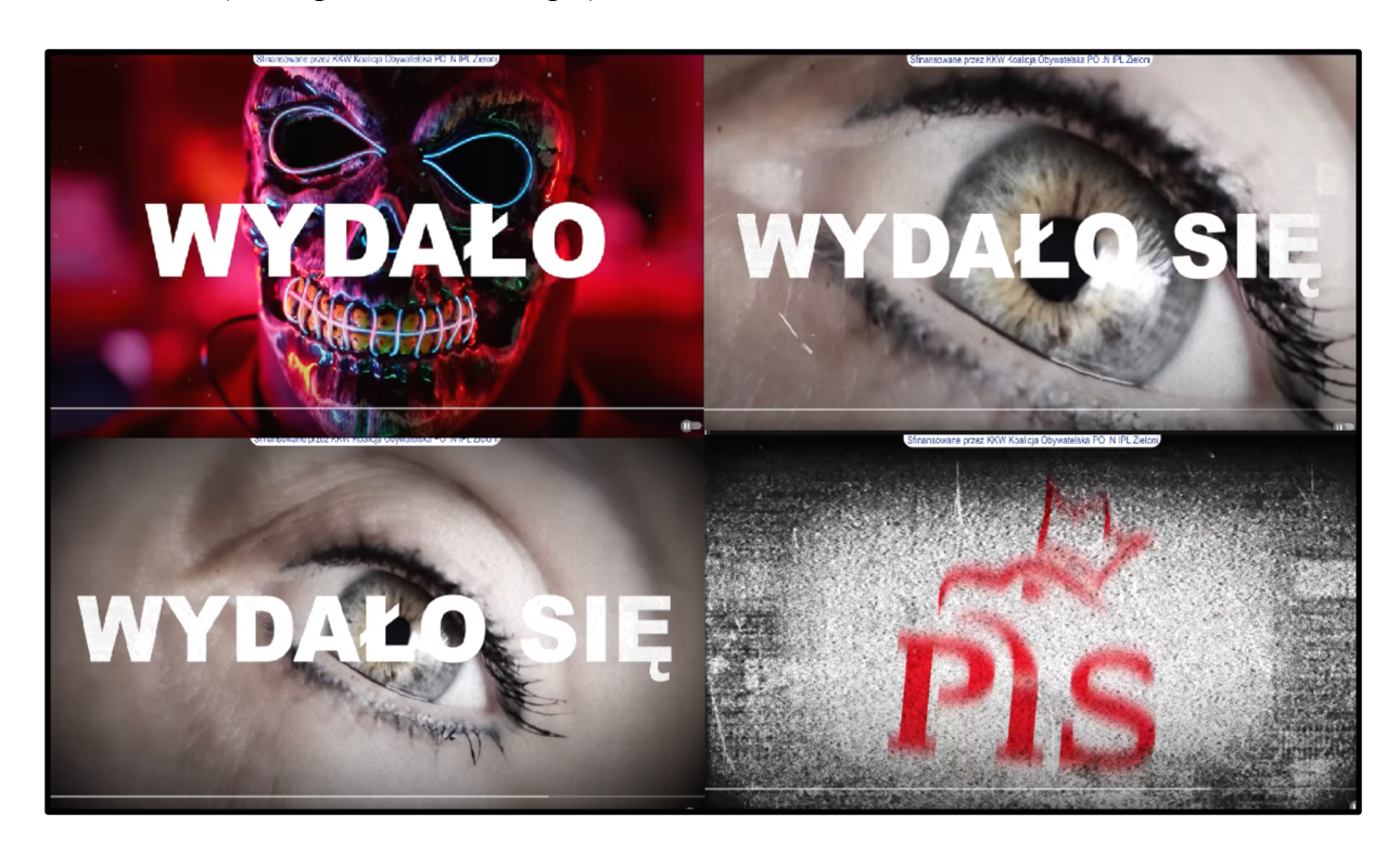
FIGURE 4. Showing PiS as hiding the truth about illegal migration

two functions: first, it shows the consequences of the Polish government's migration policy, portraying it as "diabolical" so to speak, as it allegedly resulted in putting Poles in grave danger; second, it is meant to associate Law and Justice with it, as two shots later the red PiS logo appears on the screen (see Figure 4, bottom right).