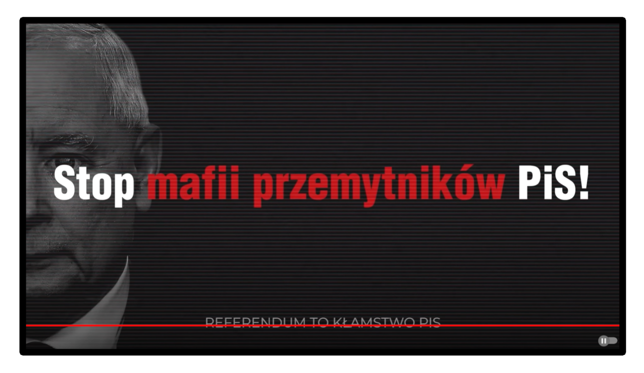
FIGURE 1. Accusing PiS of facilitation of human trafficking

the barrier is approximately 5.5 meters high, the walls are made of steel, and there is barbed wire on top of them (Stępka & Mazurkiewicz, 2024). Moreover, while the ad states that "[the fence] can be cut with an ordinary saw blade" (można go przeciąć zwykłym ręcznym brzeszczotem), this is an exaggeration as such tools are only capable of gouging of an already existing cut (Szpyrka, 2023). Also, the video ends with an exclamation "Stop the smuggling mafia of PiS", which suggests that it is in fact the formation led by Kaczyński which is responsible for the outbreak of the border events; furthermore, in the narrative of Civic Platform, the party is supposed to not only condone human smuggling, but even actively participating in it (see Figure 1).