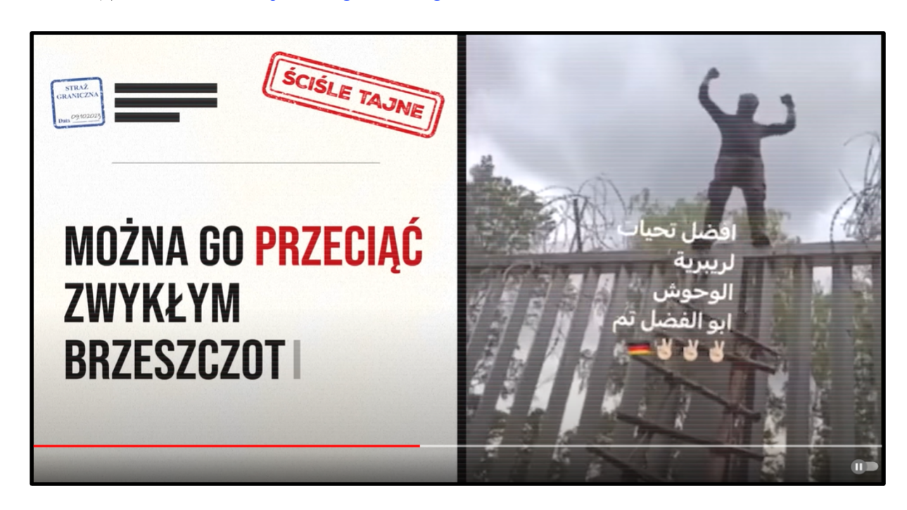
FIGURE 3. A young masked man crossing the Poland-Belarus border

One may also notice certain fragments of the videos with text written in Arabic. The dates and emojis (saluting face, fire, flag of Germany; Figure 2 and 3) suggest they show successful attempts of crossing the barrier at the border. Not only does this portrayal limit the discursive construction of "immigrants" to solely Arabs, but it further associates them with threat and danger as the "Arabs" in the video are shown as dangerous and breaching the law, which strengthens the narrative of Civic Platform that the people of the border are exclusively from Arabic countries, simultaneously referring to the stereotype in Polish migration discourse post-2015 that Arabs are potential terrorists and criminals (see e.g. Konopka, 2019; Goździak & Márton, 2018). Moreover, the video suggests that the people at the border are predominantly interested in accessing Germany. This may be interpreted as a delegitimization strategy as they are shown as economic migrants who want to get to a country with a developed social system, not seek asylum by fleeing war in their own countries.