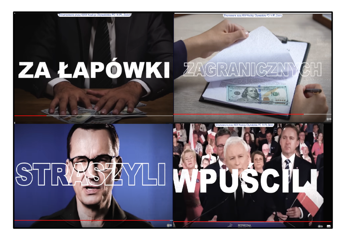
FIGURE 7. Portraying the PiS government as corrupt and responsible for the dangers