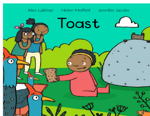
FIGURE 2. Wordless storybook given to the participants for the second task