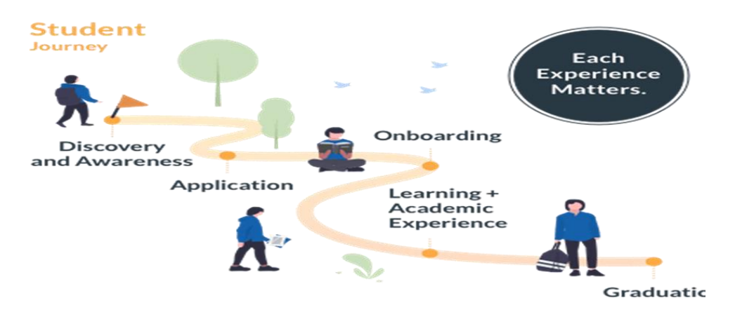
Figure 1. Adapted from BluenotesGlobal (2022)

University transitions are conceptualised into three phases as follows: transition as induction which refers to experiences of students at the point of entry into the university from application to formal orientations and the initial student engagements in the new community; the second being transition as being and this refers to the student experiences of the developmental years of the university. This is the phase where a student gets immersed into the insertional culture and starts elements of the student identity on campus are beginning to emerge and take shape; lastly, there is the phase of transition as becoming which refers to the student's experiences at the exit level. This phase speaks directly to what the student is taking back to the community, or the world of work as informed by the university experiences. In other words, the last phase depicts how has the university shaped the individual. Notwithstanding this broad conceptual understanding of transition, the focus of this paper is on transition as induction because the aim is to investigate students' experiences at the phase of entry into university. These experiences are critical for evidence-based and tailor-made interventions to be initiated by relevant stakeholders to address specific student experiences. The figure below is an example of an ideal student journey.