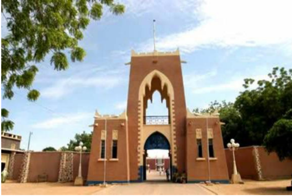
Figure 1.2: Main Entrance to Kano Emirate Council