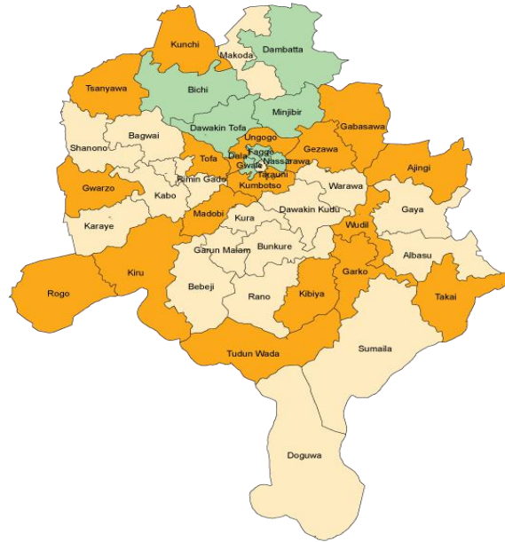
Figure 1.1: The Map of Kano State and its 44 Local Governments