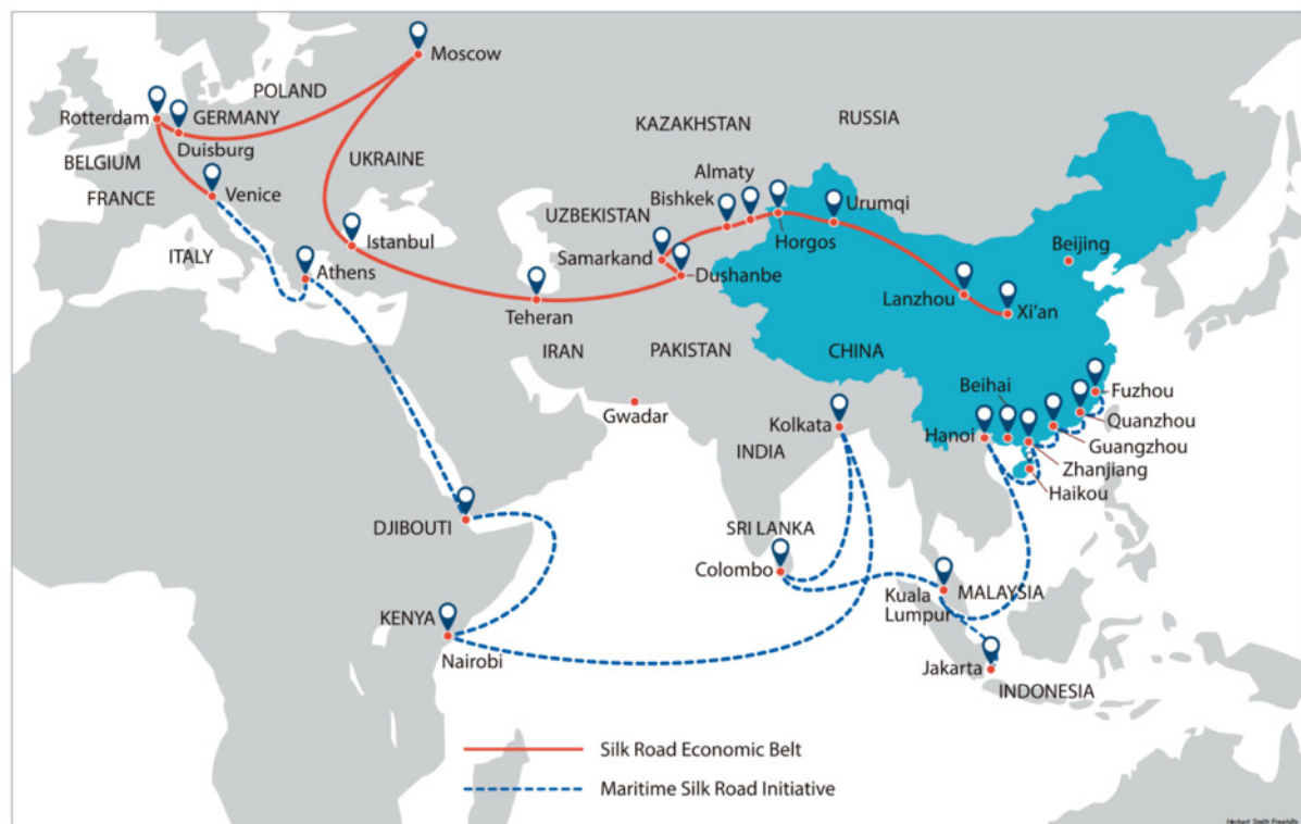
FIGURE 1. Map of China's Belt and Road Initiative

(2) China's national security policy and (3) the BRI's economic impact and influence on current regional political conditions. To date, China has spent an estimated US$200 billion on such efforts. Morgan Stanley has predicted that China's overall expenses throughout the BRI's entire course could reach US$1.2 to 1.3 trillion by 2027, though estimates on total investments vary (Chatzky & McBride 2020).