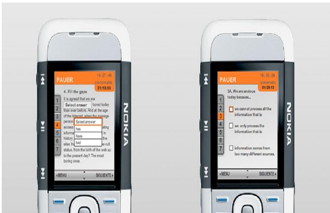
FIGURE 3. Adaptation of the different types of question for ESP testing and m-learning. Multiple choice tasks.