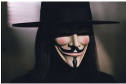
Hikayat Mamak Bendahara

The author is a not so conventional Malaysian; he wishes, desires and loves to remain anonymous in the blogging world. The blog reflects the author’s view of the Malaysian political and social scene; he claims no responsibility on the repercussions or influence his writings may have to the world at large. ( http://hikayatmamakbendahara.blogspot.com/ )